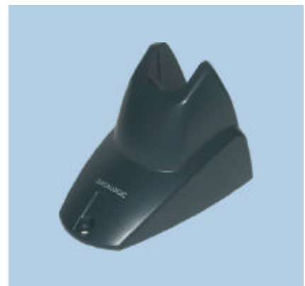
STD Heron™ Hands-Free Stand with optional metal plate